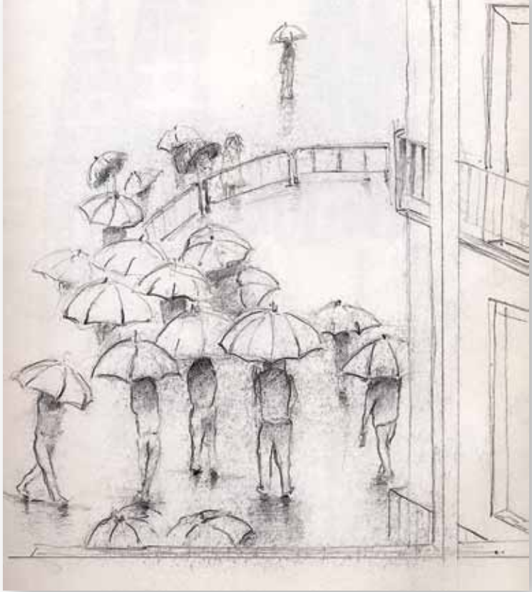
Fig. 1: Spectators in the Rain, Barcelona, Spain

Pencil on paper drawings by Raúl Manzano