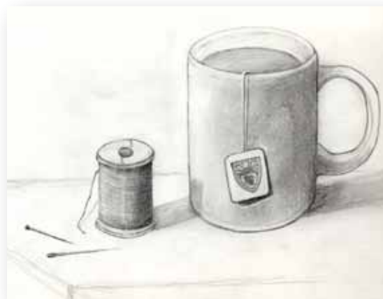
Fig. 6: Tea