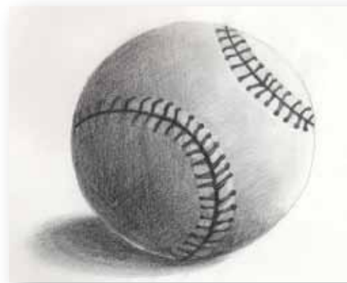
Fig. 5: Baseball (Chiaroscuro)

When drawing, think like an Olympian athlete. To be a champion, you have to practice and aim to do it as best as you can. Draw every day.