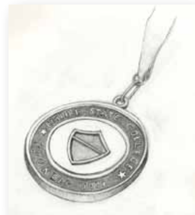
Fig. 7: Yes!