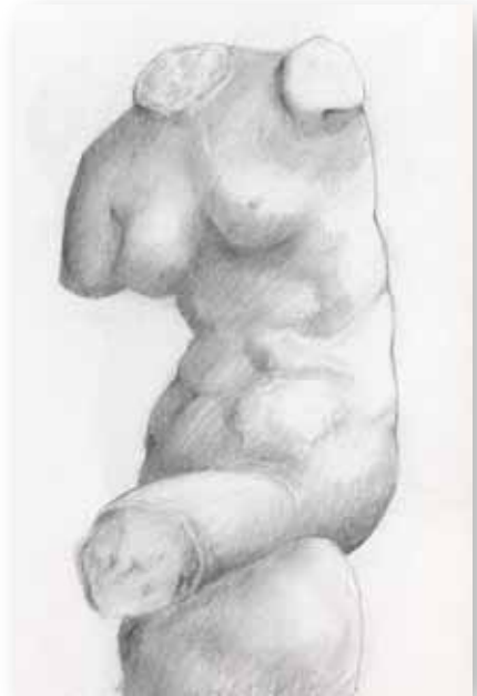
Fig. 3: Torso