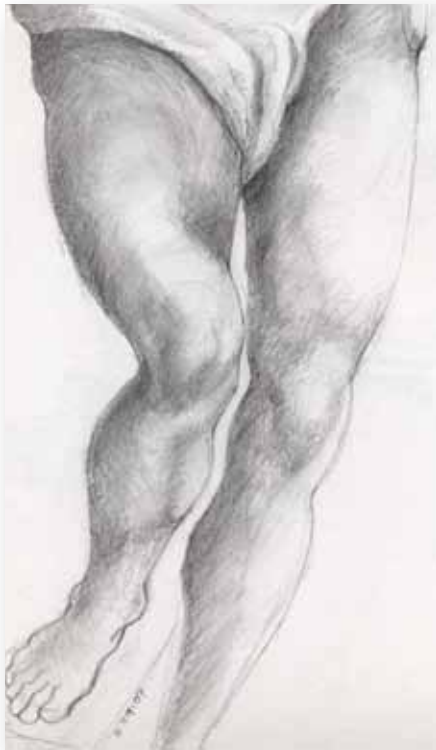
Fig. 2: Study for figure