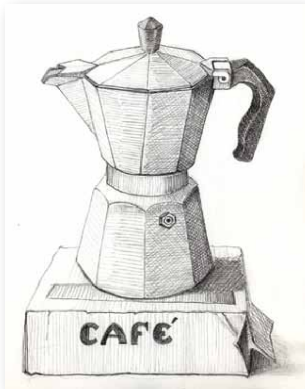
Fig. 4: Cafe (hatching and crosshatching)