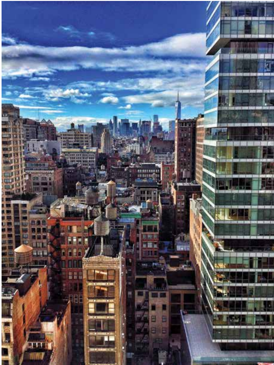
Paul Kurland – “the world is blue and green, people don’t see color” (photo)