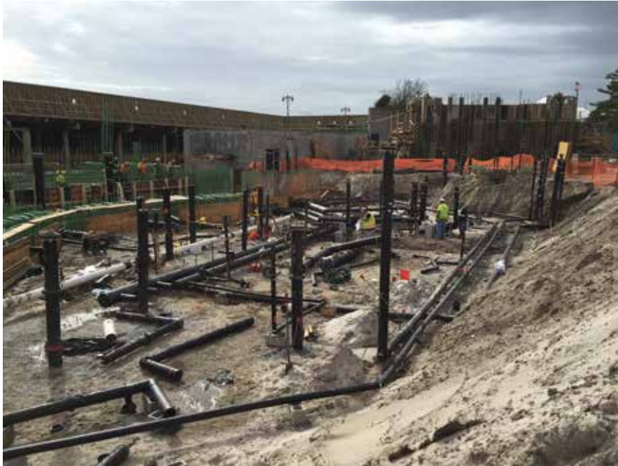
Brandon Biggio – “Foundations” (photo)