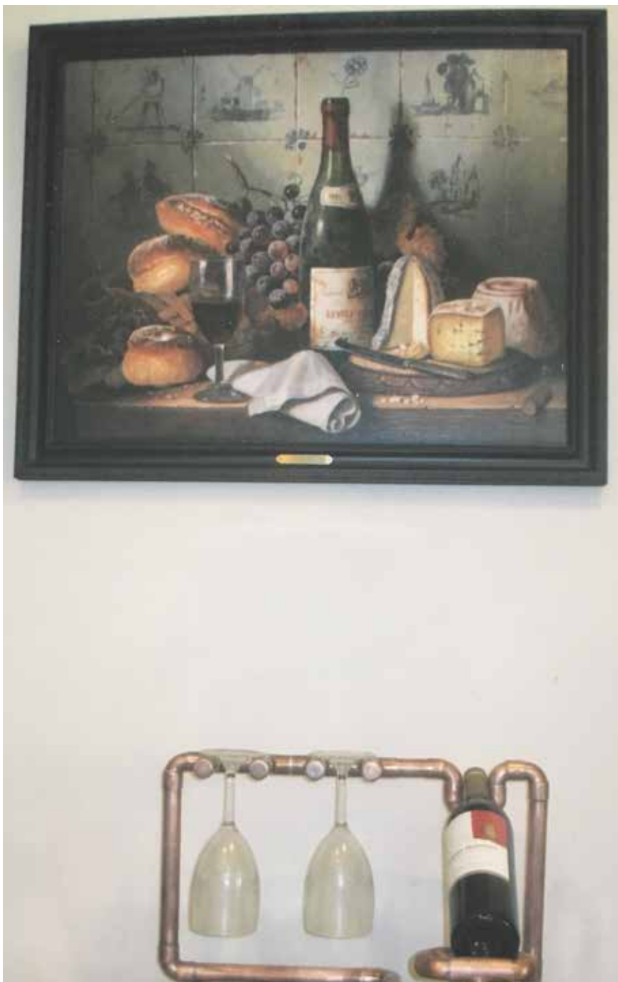
William Catanese – “The Wine Rack” (copper sculpture)