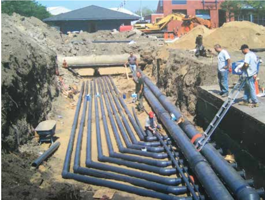
Chris Briscoe – “Alignment #2 (Pipework Trench)” (photo)