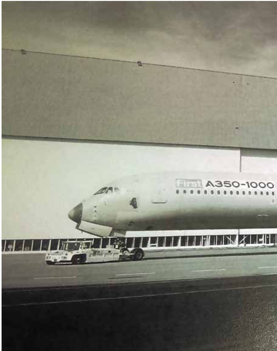
Marie Cox – “I am created here” (photo)