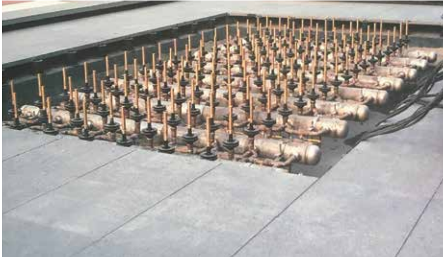
Chris Briscoe – “Alignment #1 (Eight Cylinders)” (photo)