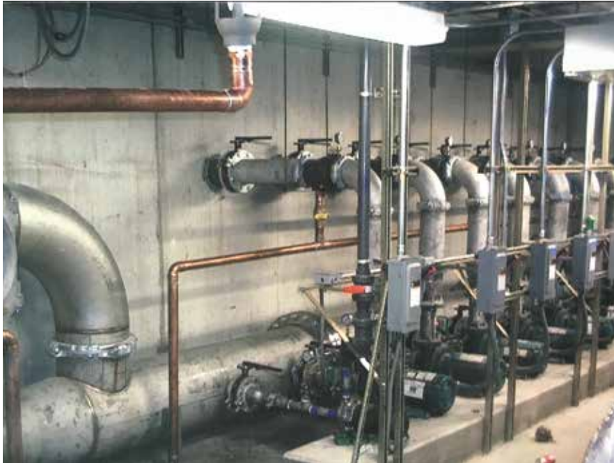
Chris Briscoe – “Alignment #3 (Industrial Pipe Space)” (photo)