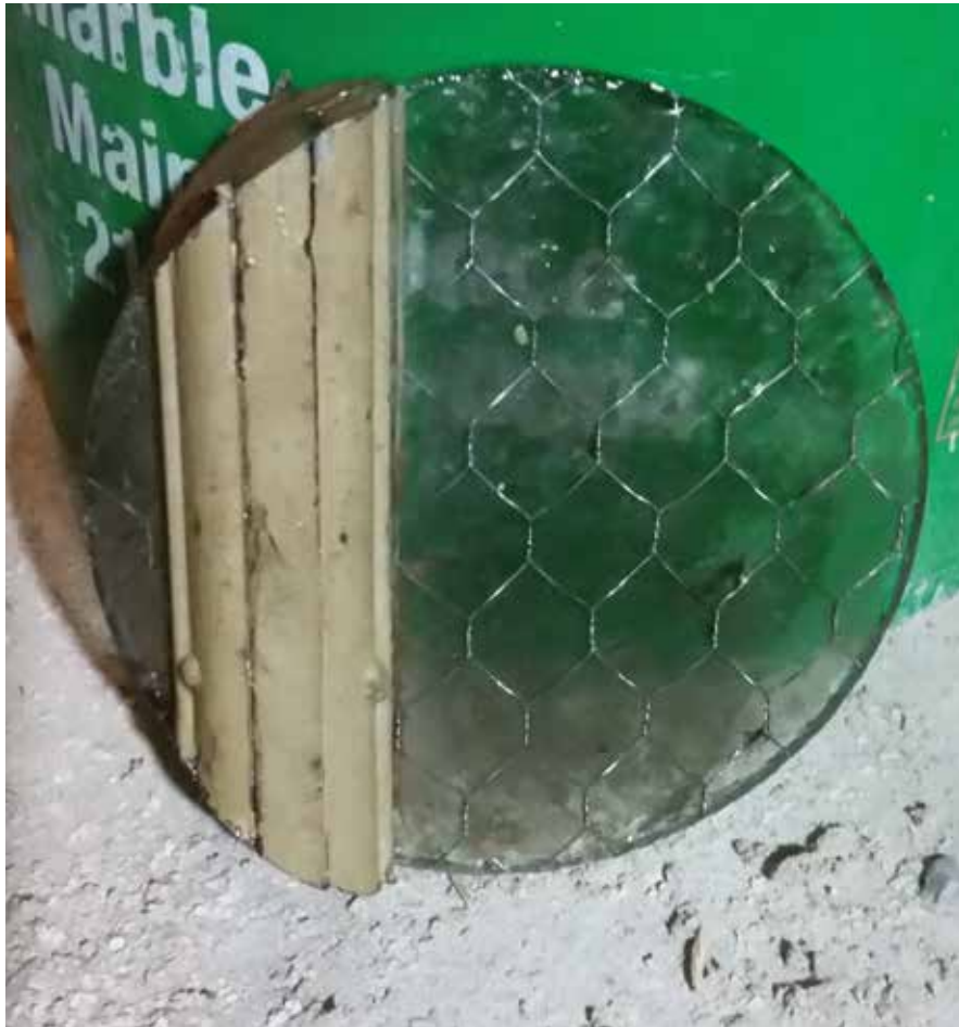
Joe Brasile – “Cartier Glass” (photo)