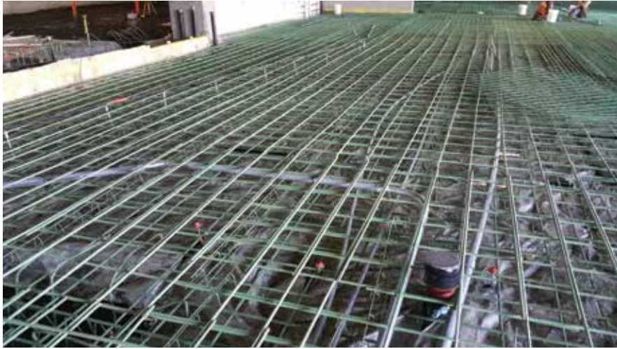
Shawn Barry – “Plumbing Interior Construction” (photo)