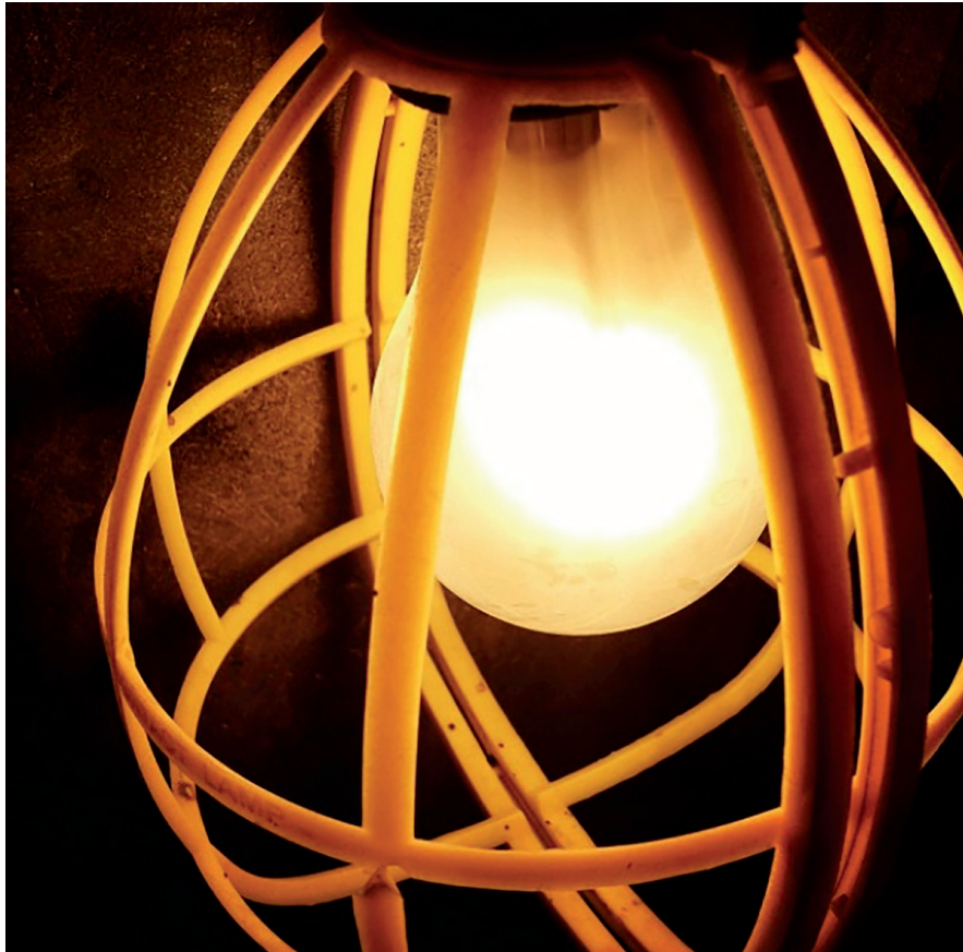
"Caged Light" by Shaun Brohan